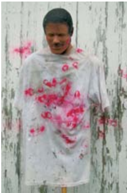
The FN 303 easily put projectiles on a full-size mannequin from the maximum engagement range, and it did it at the rapid-fire rate of one shot per second.

The 15-round drum-style magazine has a clear back for easy ammunition identification and round count. The magazine fits easily into the magazine well with the release molded into the front forearm of the receiver directly in