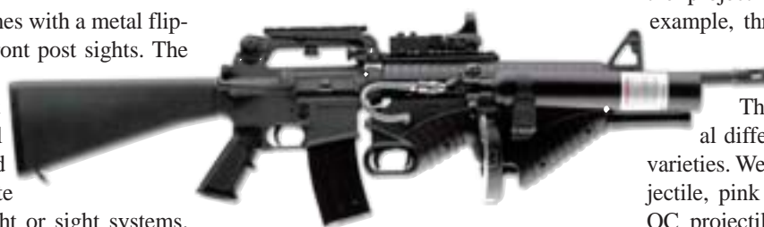
The FN 303 Launcher is made up of the stock, receiver, air tank and magazine. Without the stock, the launcher easily attaches to an AR-15.

Based on Los Angeles County Sheriff testing, from 75 feet, the average