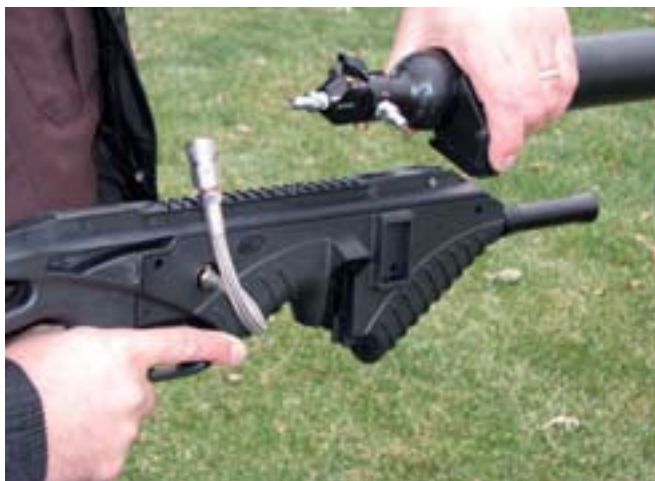
The FN 303 operates off a high-pressure, low-volume compressed air tank filled from a SCUBA tank.