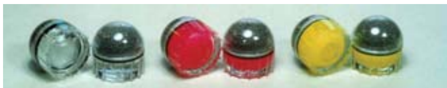
The FN 303 projectiles include clear impact, washable pink and yellow permanent paint. The orange OC projectile (not shown) has been upgraded to PAVA.

To post your comments on this story, please visit www.trmagonline.com