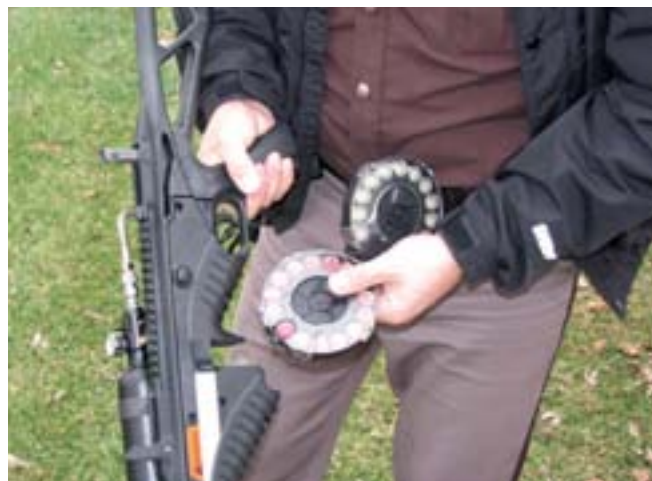
Magazine changes take about 3 seconds. Loading a new magazine takes about 20 seconds.

re-engagement of the safety without a little help.