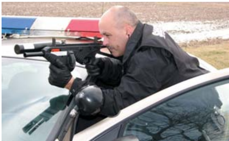
The FN 303 is a reliable, well-built, and very accurate less-lethal option. The FN 303 should only be deployed by someone fully risk trained in its capabilities.